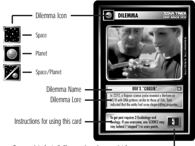
Bonus points (not all dilemmas have bonus points)

encountered again the next time a player attempts that mission. Once the dilemma is overcome, discard it. (See discard pile .)